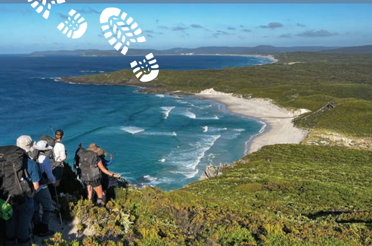
Bibbulmun Track - Conspicuous Bay, Nornalup