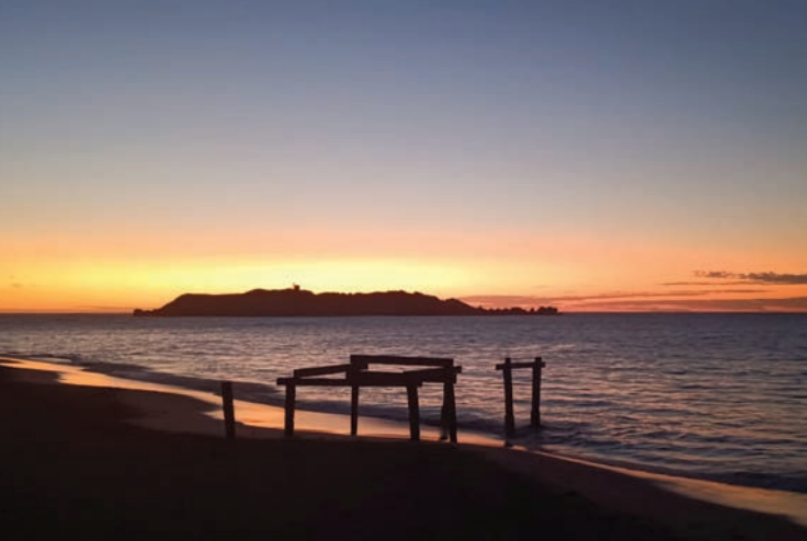
Cape-to-Cape Track - Hamelin Bay at sunrise