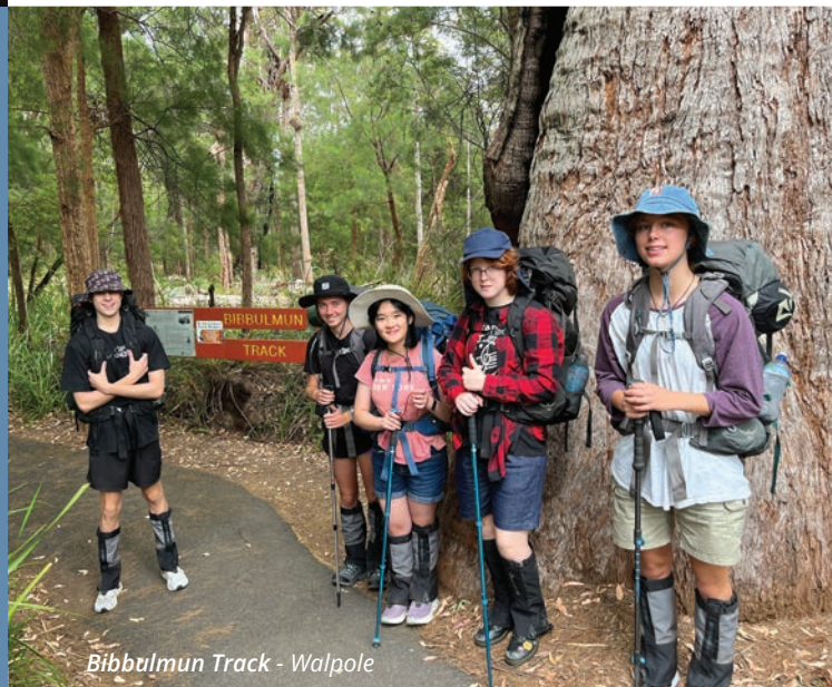
Bibbulmun Track - Walpole