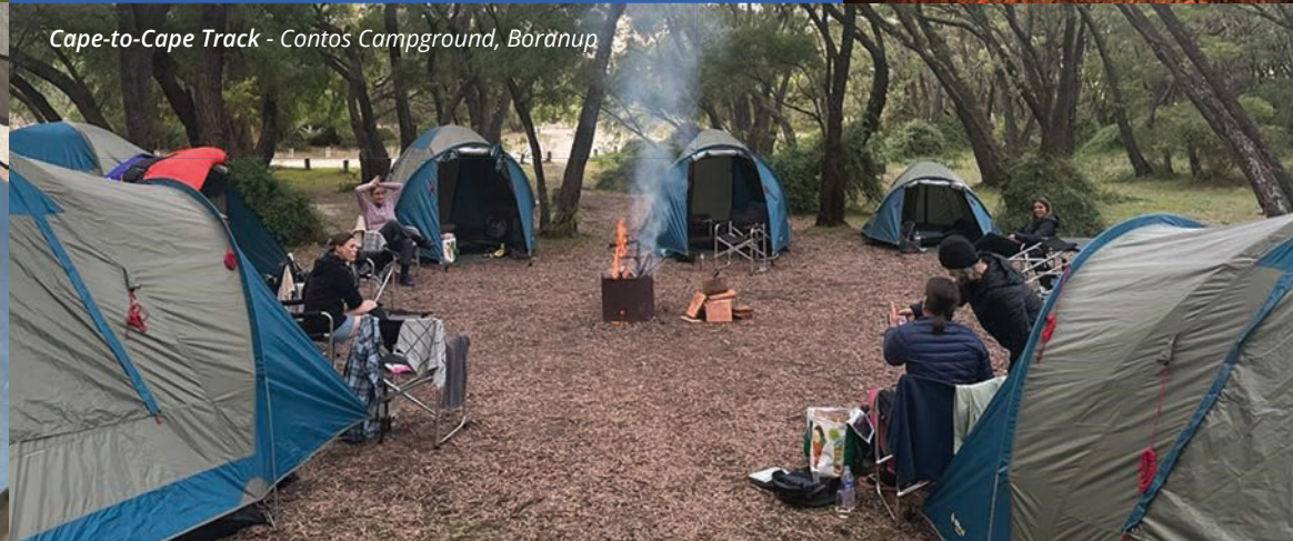
Cape-to-Cape Track - Contos Campground, Boranup