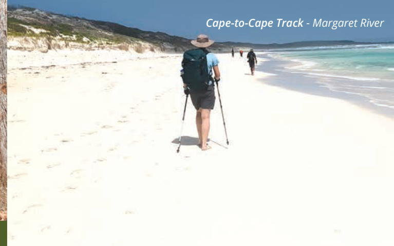
Cape-to-Cape Track - Margaret River